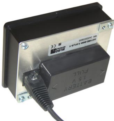
AZ16E rear: with battery case and plug connector