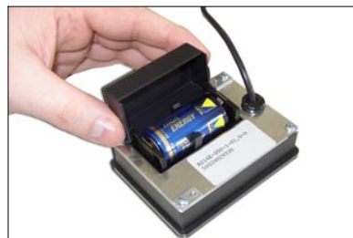
Battery change without any tool