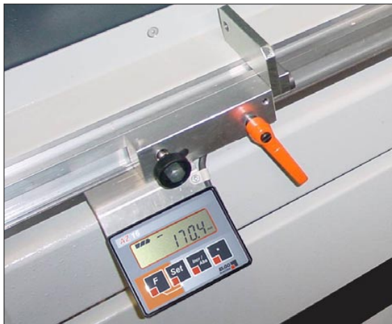
AZ16E application example: manual gauge

The sensor will be moved contactless over the magnetic tape. It is resistant against abrasion, dust, dirt and water (protection class IP 67). The user must provide and guarantee for a suitable mechanical guiding system, to guide the sensor and keep it along the whole movement in the correct distance (0... 1.5 mm) to the magnetic tape. The sensor must be installed coplanar to the tape.