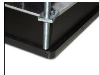
Easiest panel installation