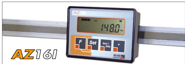
AZ16I: This version is with integrated sensor and with a complete Guide rail (incl. magnetic tape) is also available